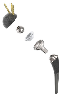
Figure 1. Hip Innovation Technology (HIT) Hip Replacement System (HRS).

The Hip Innovation Technology (HIT) Hip Replacement System (HRS) is designed to enhance stability and reduce the risk of dislocation when compared to current, conventional Total Hip Arthroplasty (THA) systems. In addition, the system has been designed to improve overall contact between articulating surfaces to reduce edge loading and subsequently reduce wear. Like all conventional hip replacement systems, the HRS consists of a femoral stem, an acetabular cup, a cobalt-chrome ball, and a highly crosslinked high molecular weight polyethylene liner. What makes the HRS unique from currently available hip implants is the implementation of a reverse geometry, as shown in Figure 1. With the HIT HRS, a cobalt-chrome ball is fixed to the acetabular cup and a polyethylene lined femoral cup is attached to the femoral stem; standard THA systems have the polyethylene liner attached to the acetabular cup and the cobalt-chrome ball attached to the femoral stem. The polyethylene lined femoral cup now glides around the fixed acetabular ball. By reversing the geometry, the HIT HRS maintains greater contact area between the acetabular and femoral components. This increased contact area enables the HRS to provide enhanced stability, even at extended ranges of motion, in all directions with minimal risk of dislocation. The system is designed for use without bone cement in total hip arthroplasty.