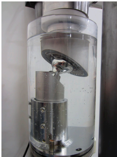
Figure 2. Test setup for corrosion evaluation via ISO 7206-6.

The corrosion potential of the reverse hip system was evaluated using an extended fatigue test. Specifically, the reverse hip system was dynamically tested via ISO 7206-6: 1992. Six hip stem assemblies were oriented at 10° adduction and 9° flexion such that the prescribed load was applied non-parallel to the plane of the neck as designated within the standard. The cementing level was the transection level of the femur as indicated by the superior edge of the porous coating. A custom load application fixture was manufactured to hold the acetabular component at the respective angles. The load applicator was mounted to a self-centering mobile bearing to allow for horizontal travel. The specimen was loaded into the test fixture, and the test chamber was filled with a 0.9% saline solution. The solution temperature was heated to and maintained at 37 °C, as shown in Figure 2. A sinusoidal load profile was applied in load control with a range between 534 and 5340 Newtons (120–1200 lbs. of force) at 10 Hz; the test was terminated at 50 million cycles.